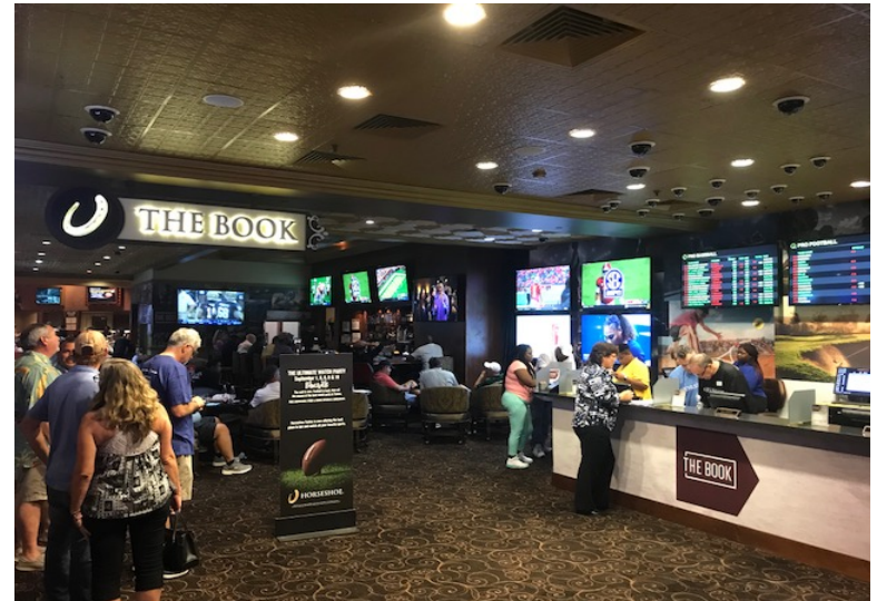
Horseshoe Tunica (MS)