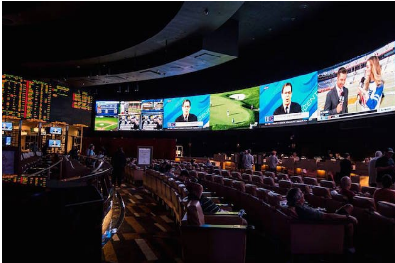
Caesars Palace - Las Vegas